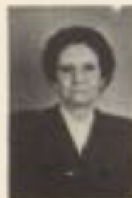
HELEN BROTHERS Music and Art Library