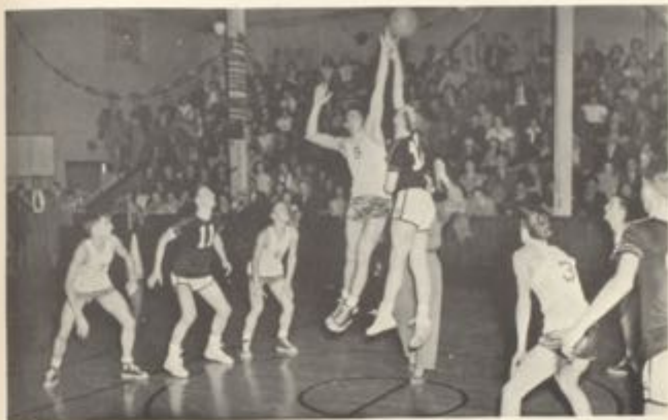
TIP-OFF OF THE RICHLAND-CHERRY GAME IN THE SPENCER COUNTY GYMNASIUM