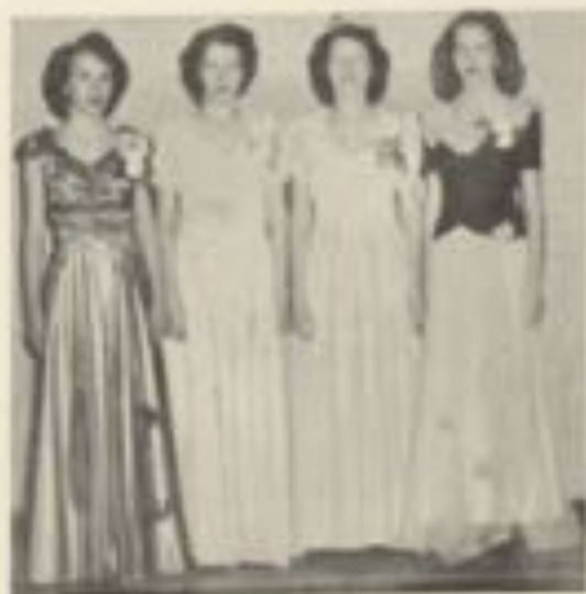
BASKETBALL QUEEN CANDIDATES